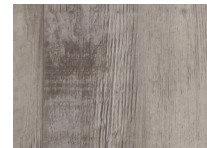
MADISON GRAY •